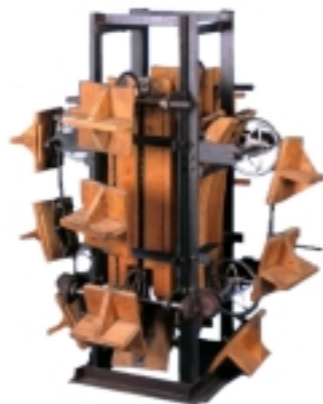
A model of the concept machine built in 1946.